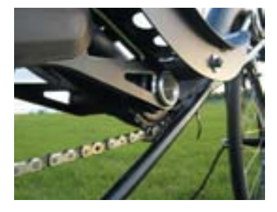
The main drive-side chain roller is really a toothed sprocket